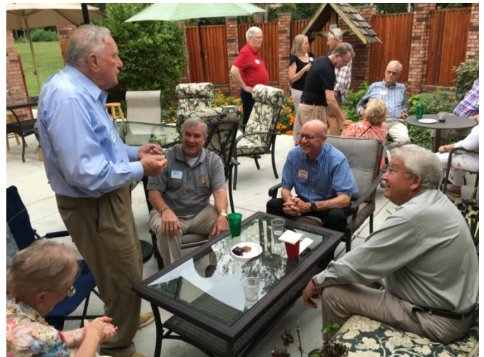
Serrans and priests on the St Jude rectory patio.

19 priests and 46 Serrans and guests attended a very nice evening at the rectory at St Jude.